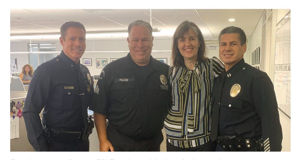
Force Investigation Division (FID) Team 1 earned third prize for the second year in a row.

Although social distancing requirements kept the team